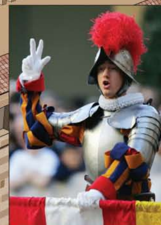
A Swiss Guard stands watch outside the door facing the Sala Regia.