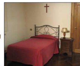
During the conclave, cardinals stay in the Domus Sanctae Marthae, a hospitality residence on the edge of Vatican City. They take short bus rides or walk to their twice-daily voting sessions.