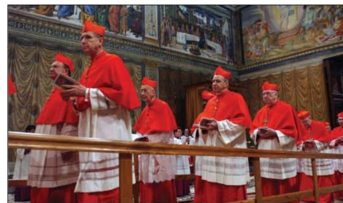
The cardinal electors process into the chapel chanting "Come, Holy Spirit," invoking divine help with their decision.