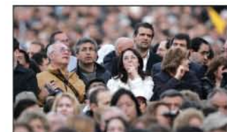
Crowds gather in St. Peter's Square in anticipation of the announcement.